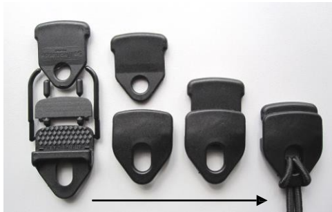
Ill. 3: attachment clip

Assemble the attachment clip as shown in ill. 3.